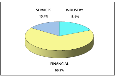
GENERAL FREE FLOAT PRICE INDEX FROM 11/9 TO 24/9/2019